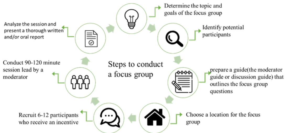
Figure 2. Steps to conduct a focus group retrieved from (Focus Groups, 2017).